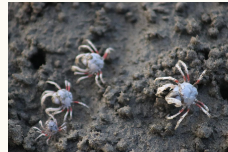
Small blue and white crabs