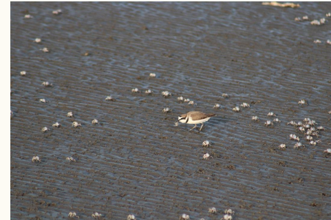
Kentish Plover and crabs