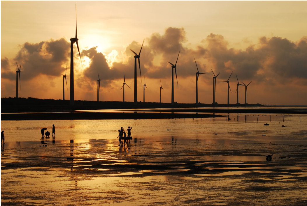
Sunset at Gaomei Wetland