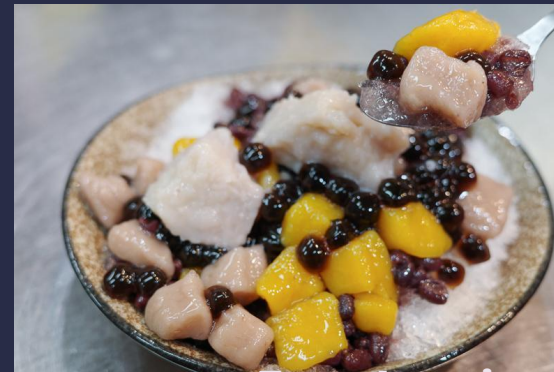
Taro shave ice