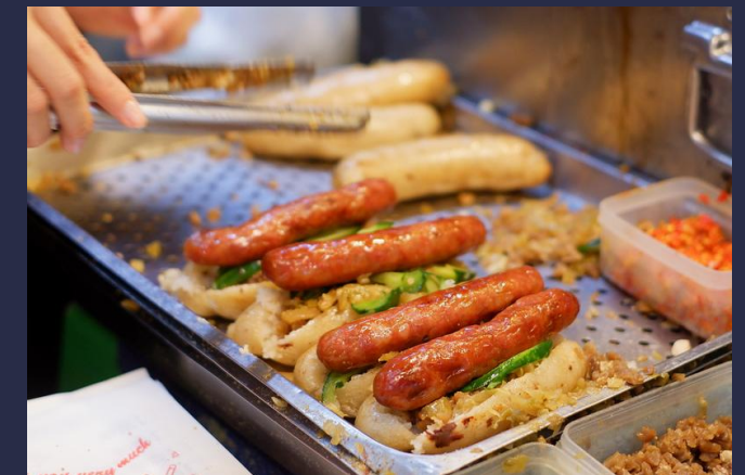
Sausage with sticky rice