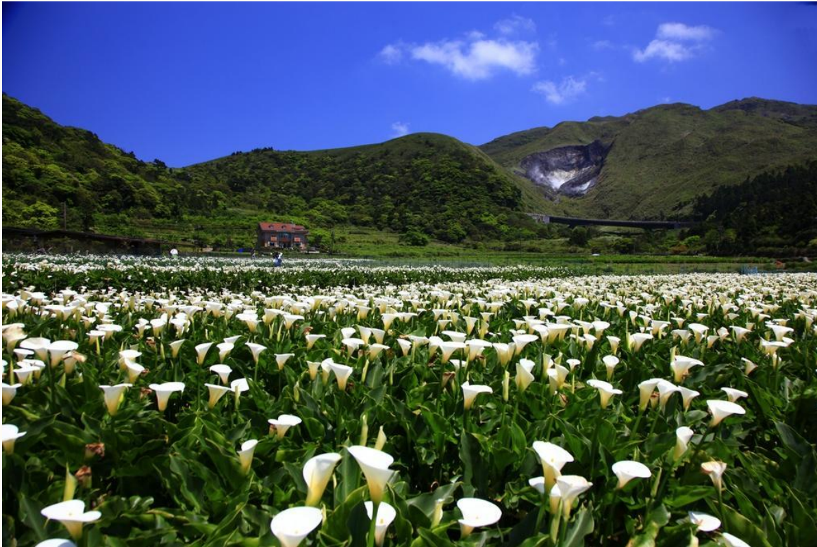
Calla Lily Field