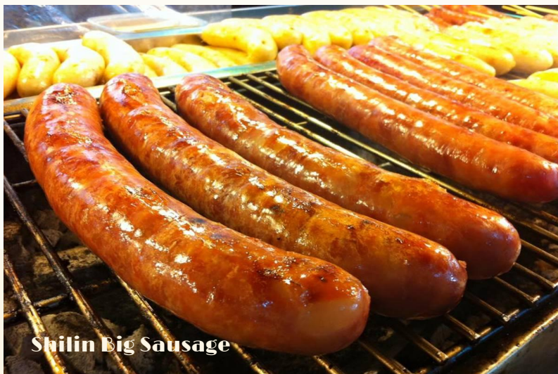
Shilin Big Sausage