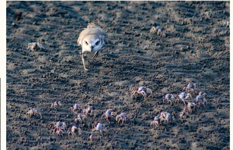
Kentish Plover chasing crabs