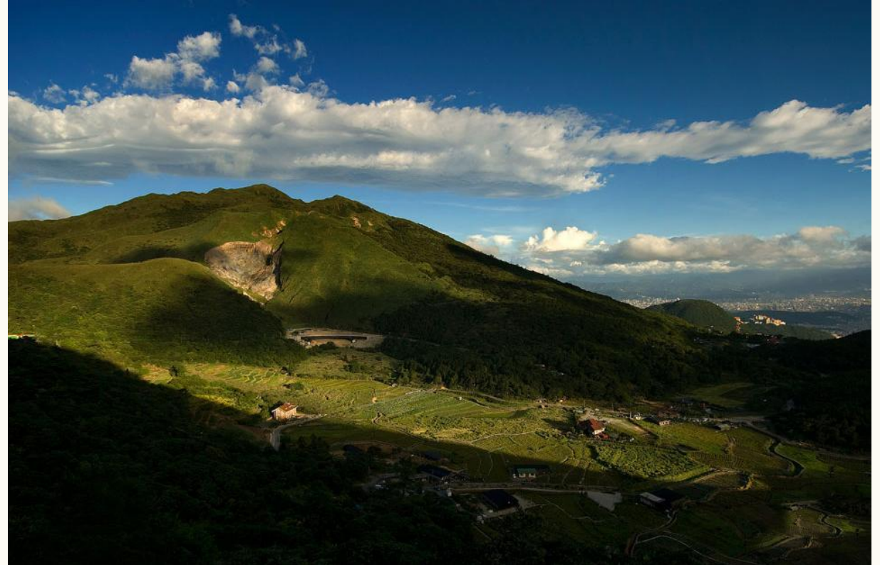
Yangmingshan Scenic view